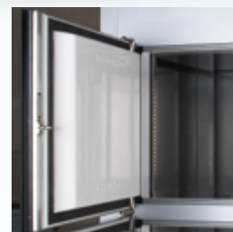
Contre-porte en ABS thermoformée ABS thermo shaped inner door