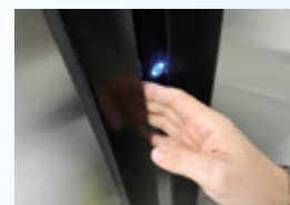
Ouverture électrique par simple effleurement (Gamme 600x800) Electrical opening thanks to light touch (600x800 range)